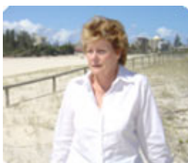
ATHOC Foundation Patron Margaret May MP – Member for McPherson – Gold Coast